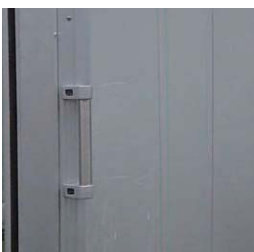
Aluminum opening/closing fitting with a handle for single leaf