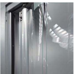
Aluminum bracket for single leaf