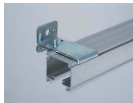
Large type single bracket