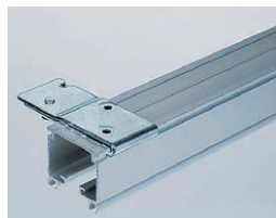
Large type ceiling bracket