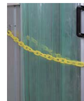
Chain lock with SUS hook