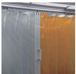
Aluminum opening/closing fitting with a handle for double leaves