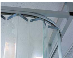
Large type aluminum curved rail (r. 500mm)