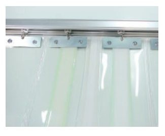
Fasten the end of both sheets with hook-and-loop fastener (width 50mm) when closed-for double leaves

with hook-and-loop fastener (width 50mm) when closed-for single leaf